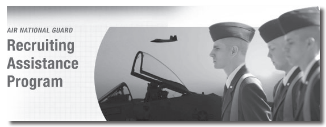
Earn up to $2,000 for each new recruit who enlists and reports to Basic Training. For eligibility information please visit http://www.guardrecruitingassistant.com/.