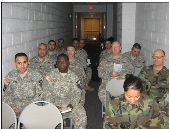
This hallway was one of the locations the chaplaincy used to support the servicemembers supporting the Inauguration.

"It seemed like we were the only Californians there," she said, because