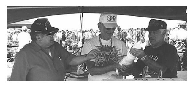
Expert Adult Beverage Servers at the Airshow!